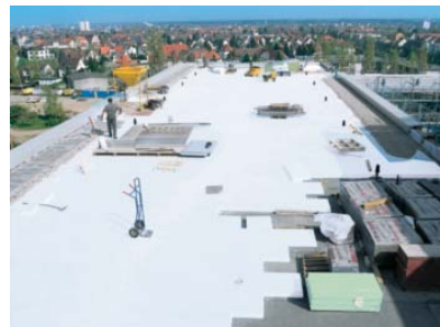
Figures 1a and 1b: Examples of uses of PS foam in insulation: XPS and EPS.

XPS and EPS respectively. Almost all XPS and EPS insulation boards for the building and construction markets, where fire-retardant properties are required, contain the flame-retardant HBCD, which has a very high Br content of 74.7 wt%. The actual level of the HBCD content depends very much on the application and the country. Different flame-retardant testing methods and requirements exist in Europe and hence various HBCD levels exist in the market. It is estimated that 77 % of EPS and 94 % of XPS in construction markets is flame-retarded.